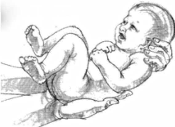
Tonic Neck Reflex Forward