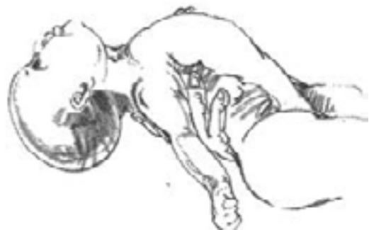
Tonic Neck Reflex Backward