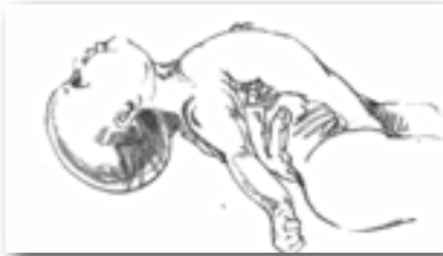
TLR: front and back

One of the main function of these reflexes integration is the development of the midline and space awareness which is so crucial for learning efficiency and behavioral self-regulation.