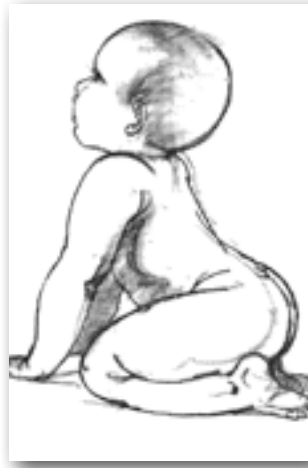
ATNR: right and left